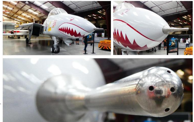
Photo of F-14A Prototype Tomcat by Shigeo Hayashibara (Arizona Pima Air & Space Museum)

Consider the nonlifting flow over a cylinder. Over the surface of the cylinder, calculate the locations where the surface pressure (static) becomes equal to the freestream (static) pressure.